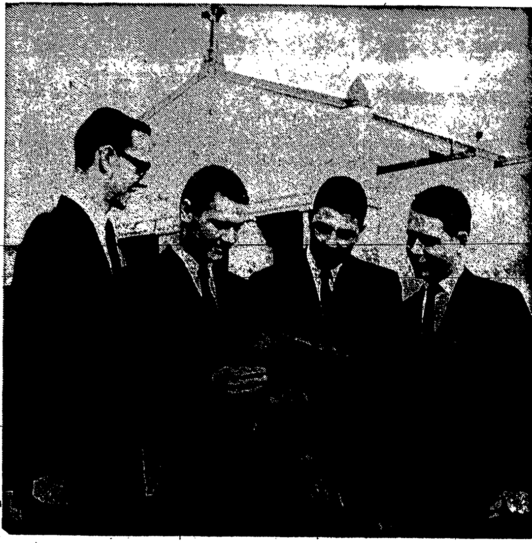
Students chart their course to guide visitors at St. Andrew's.