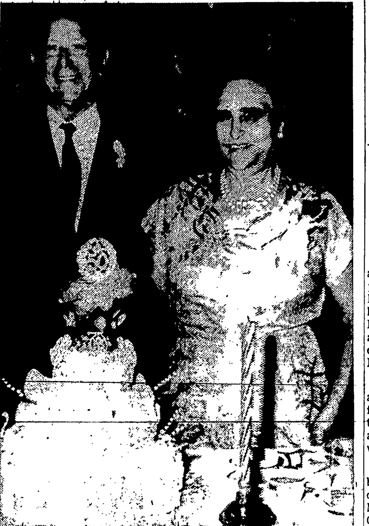
Married 50 Years