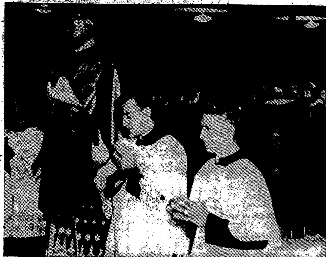
First Mass at new Cardinal Mooney High School was offered in what will be school's cafeteria.