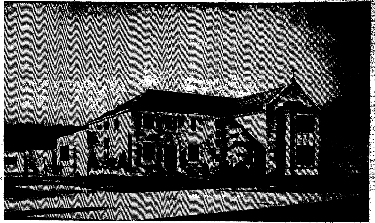
Artist's sketch shows proposed new Sacred Heart rectory.

Sunday, Sept. 16 — Holy Redeemer, Rochester; St. Casimir, Elmira; St. Mary, Dansville; St. Anthony, Groton; St. Michael, Montezuma; St. Patrick, Owego; St. Dominic, Shortsville; St. Michael, Union Springs.