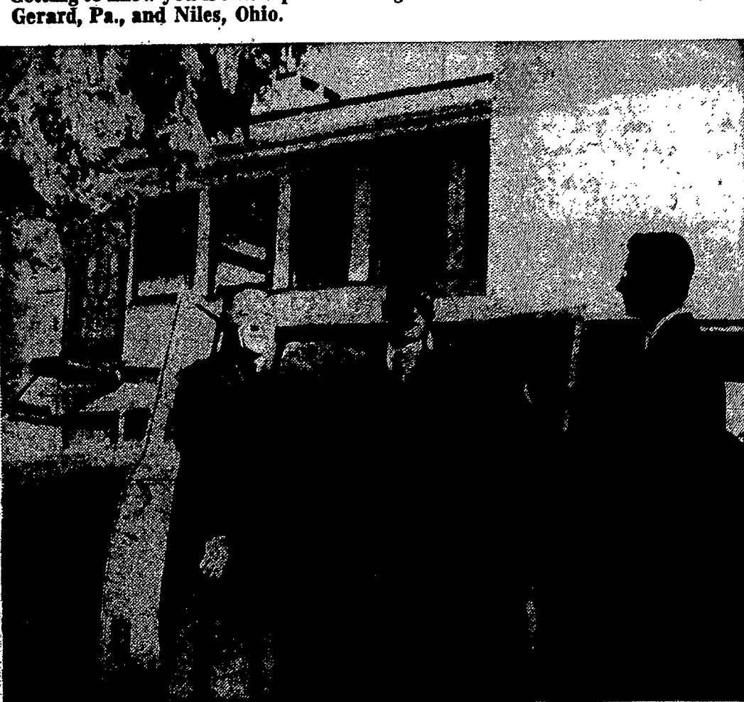
Practicus Blood students head for classes at St. Andrew's Seminary.