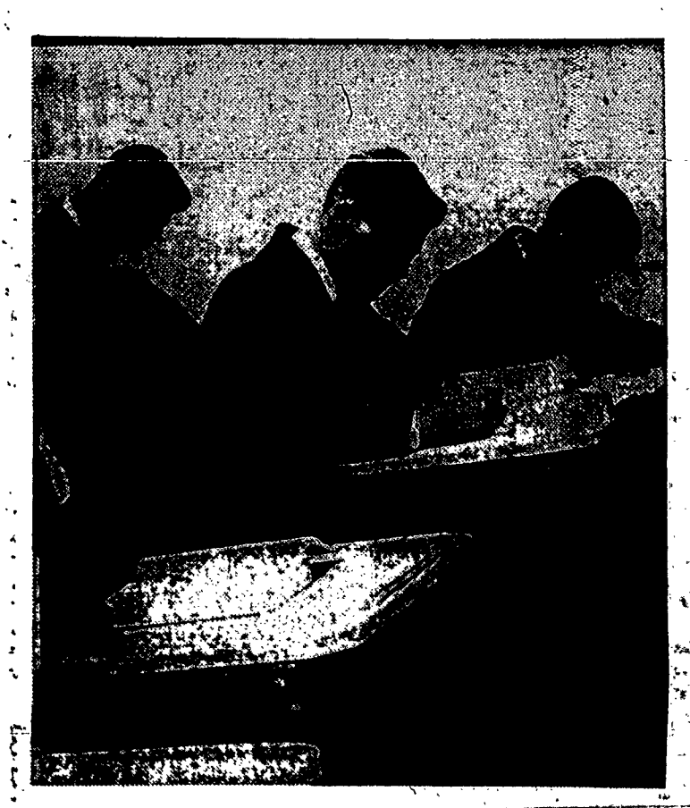
Homework and special studies are major part of evening program at new Precious Blood Seminary.

and Agriculture Organization (FAO), sets up a central food Members of the order have reserve bank to meet famines underveloped areas.