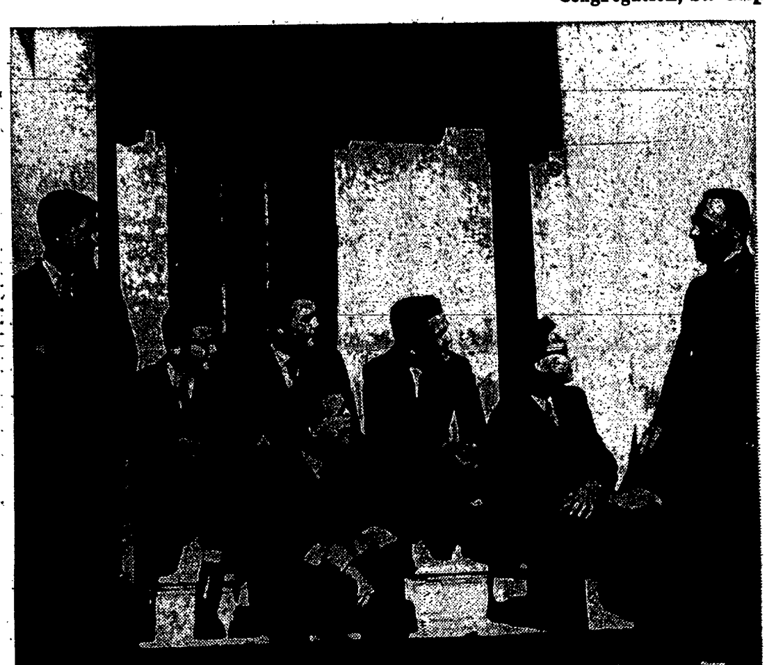
Getting-to-know-you is like a pleasant song for rector and lads from Chicago,