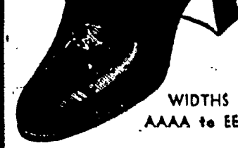
WIDTHS AAAA to EEE