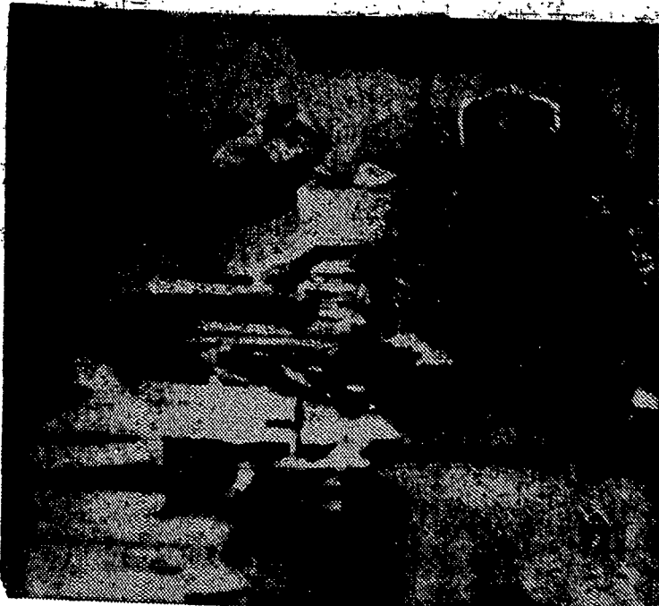
Vatican City — (RNS) — Eugene Cardinal Tisserant, dean of the Sacred College (far end of table), presides at a session of the Central Preparatory Commission of the forthcoming Second Vatican Council. The commission's third plenary meeting was held at the Vatican behind closed doors.