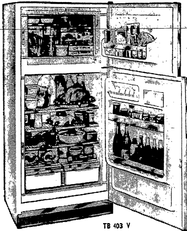
TB 403 V