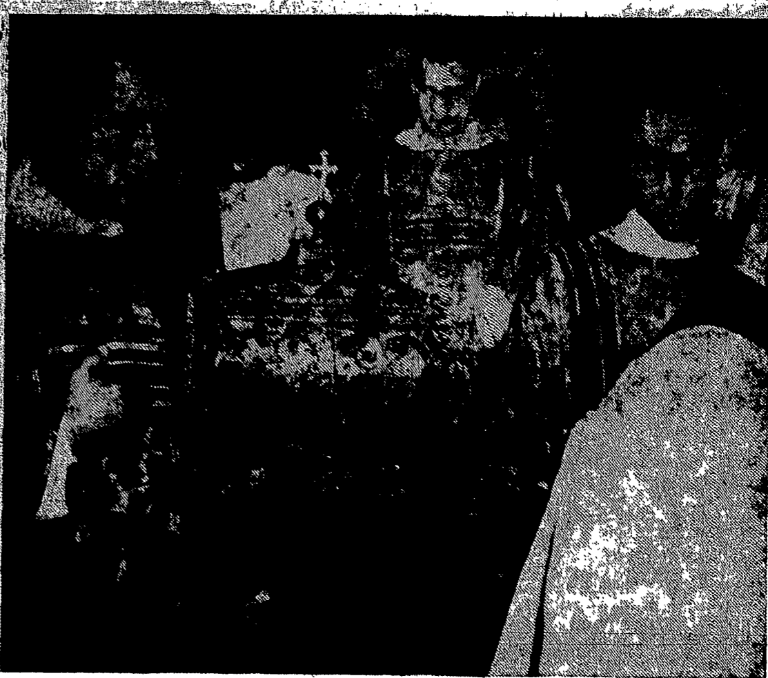
Sacred Heart Cathedral is now a consecrated church — irrevocably dedicated to the service of God. The three hour rite Wednesday morning included medieval pageantry, rituals centuries old and dramatic music. The consecration ceremony highlighted the Cathedral's fiftieth anniversary. Pictures show procession with chest containing relics of St. Lawrence and Jesuit martyrs of North America, anointing of doors and crosses with holy oils. Additional pictures and story are on pages two, three and five.