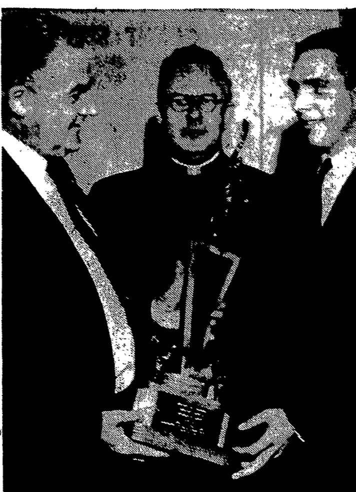
One of Ten Best in U.S.