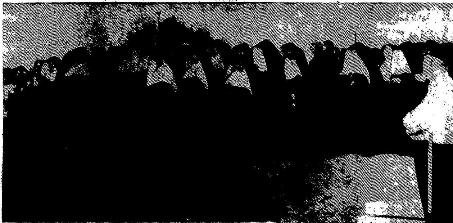
Notre Dame nuns attended cornerstone dedication rites at Bishop Kearney High School Sunday afternoon. Their order will staff the new school with Irish Christian Brothers.