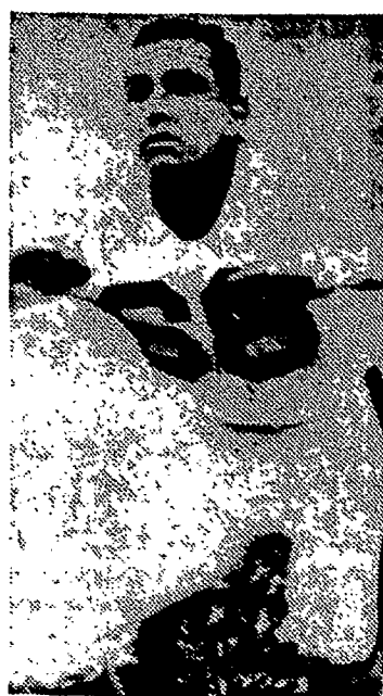
ED ALEO Tackle