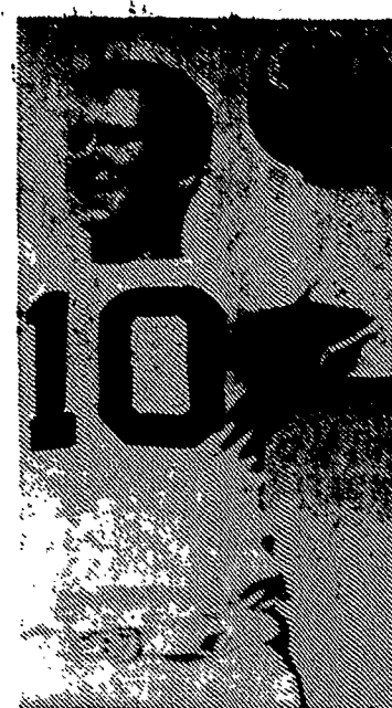
BILL ABEL Quarterback