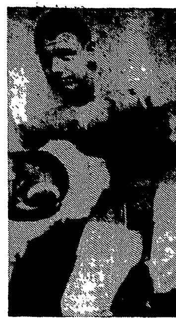
PETE CASARTELLI Halfback