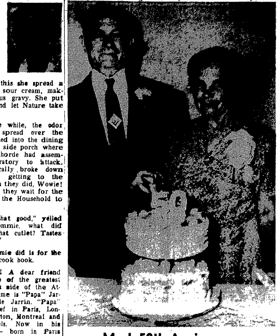
Mark 50th Anniversary

A can of tomatoes, boiled down to pure juice, smothered