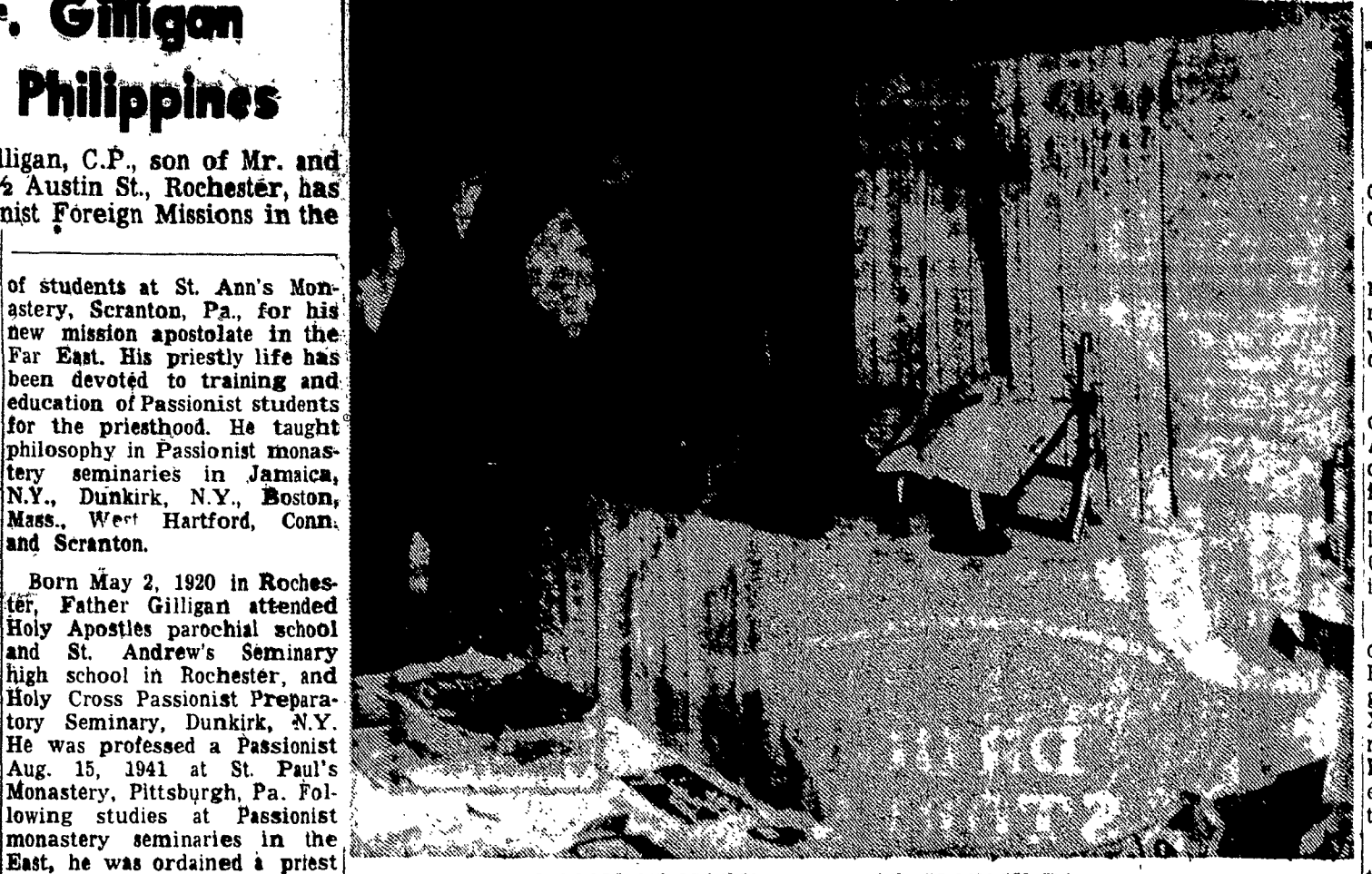
LEGION OF MARY BOOTH AT COUNTY FAIR