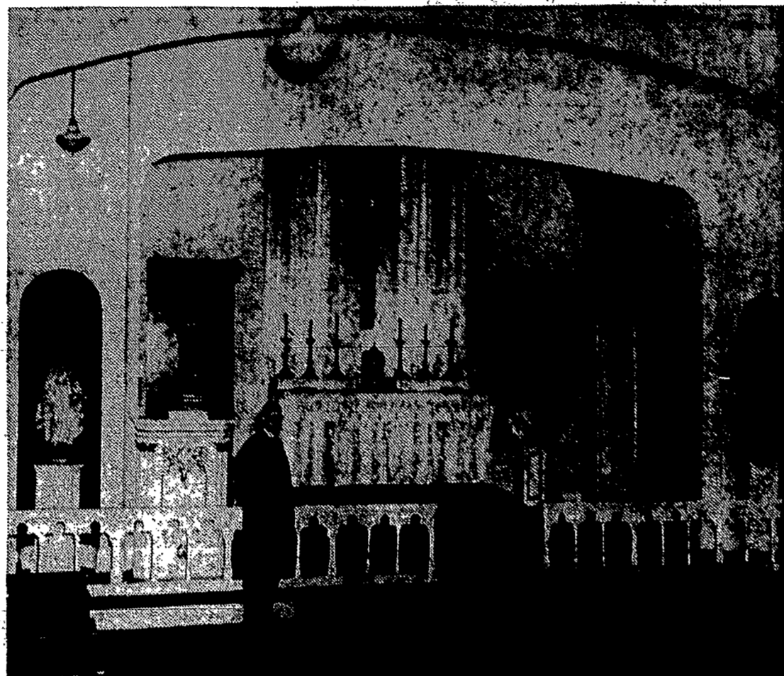
Newly redecorated interior of St. Hilary's Church, Genoa