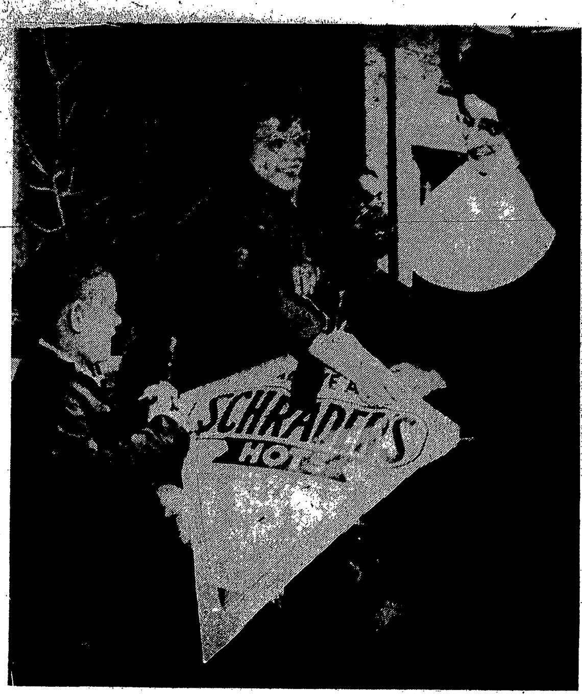
Spring is kite time at St. Joseph's Villa, under watchful eye of Sister.