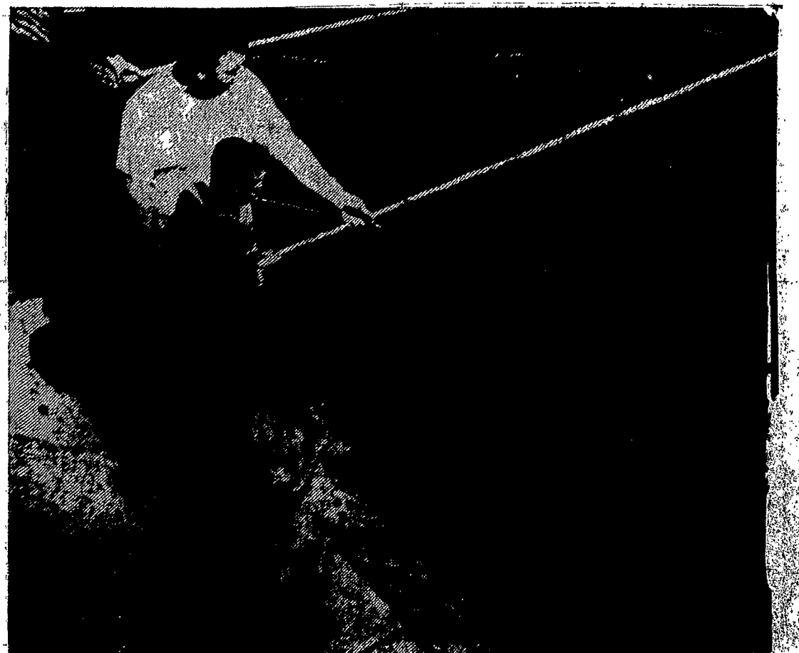
Let's go fishing — so day camp directors say OK.

Activities of the seven agencies are outlined in detail in the articles of this special section of the Courier Journal.