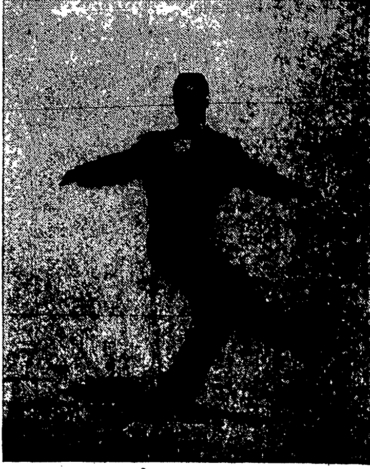
Champion Ice Skater DAVID JENKINS, winner of the Olympic Gold Medal at Squaw Valley last February, heads the cast of stars with the Ice Follies of 1961. He turned professional last year. The silver jubilee edition of the Ice Follies will play at the Community War Memorial March 14 through 19.