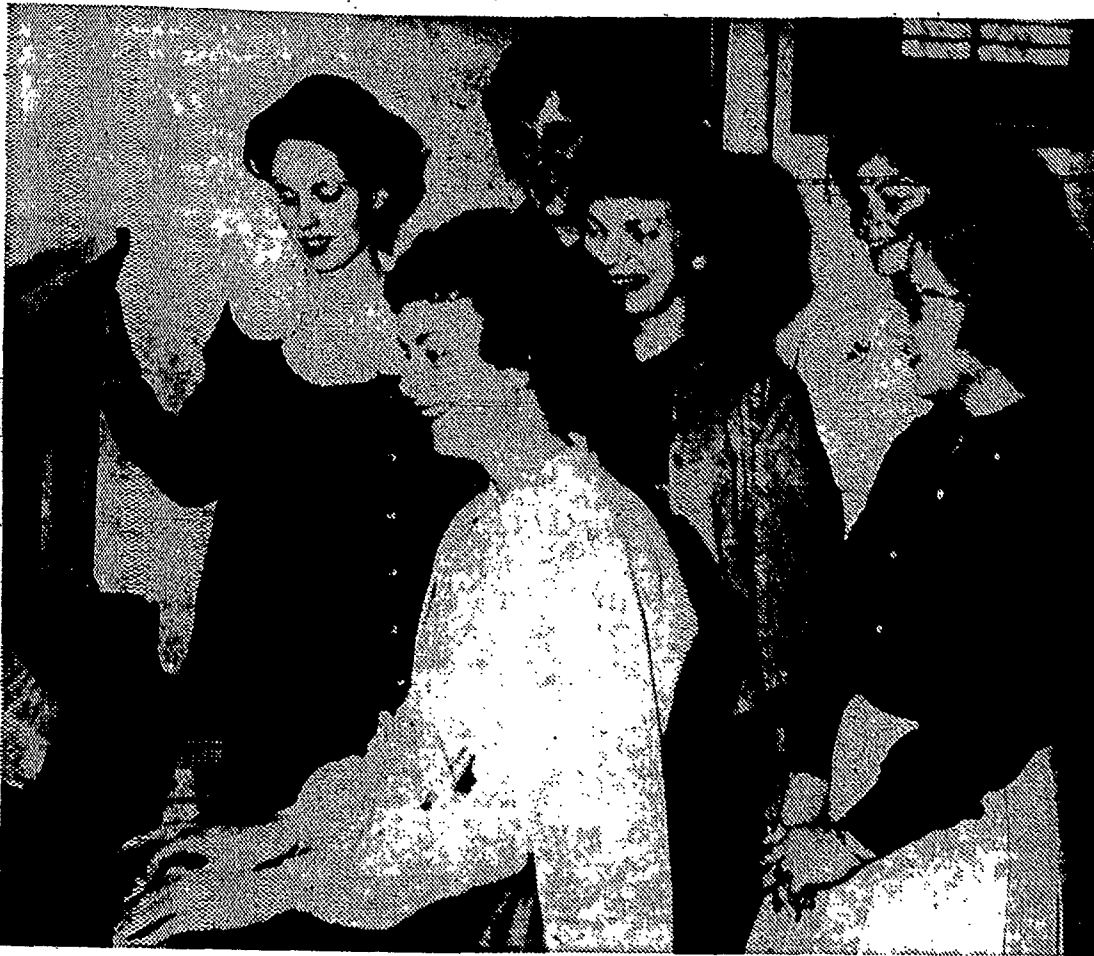
NAZARETH COLLEGE students rehearse at the piano for jazz concert, highlight of annual Winter Weekend festivities.