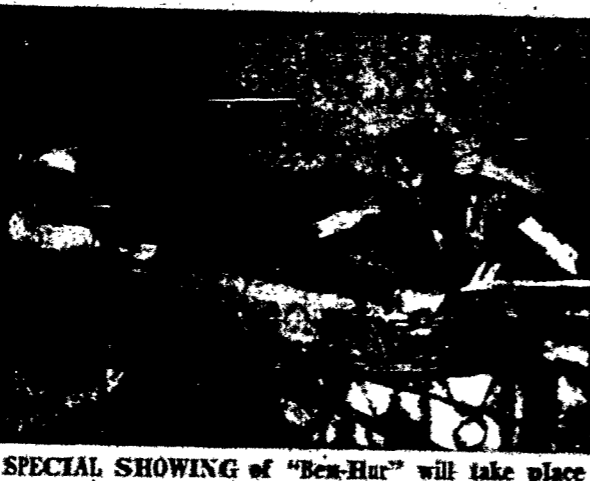
SPECIAL SHOWING of "Ben-Hur" will take place next Thursday at Schine's Riviera Theatre.

ICE CAPADES will appear at the Rochester War Memorial Dec. 6 through 11. A scene above shows a portion of the cast in its production of "The Wizard of Oz."