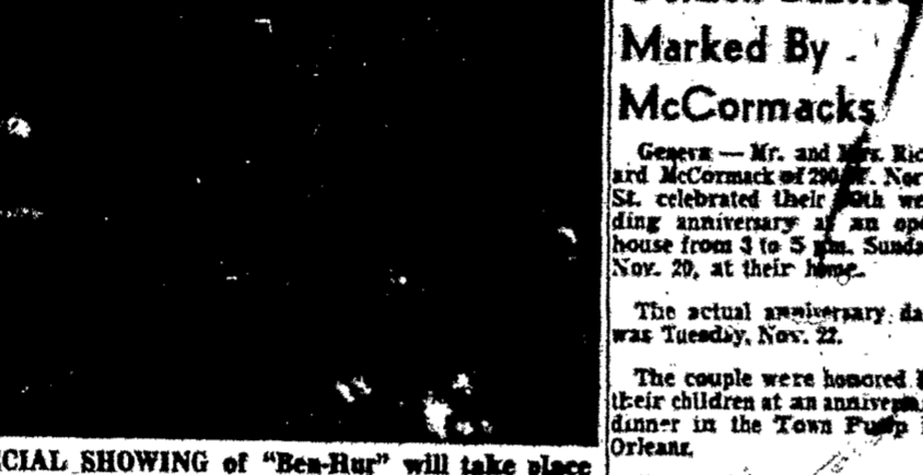
SPECIAL SHOWING of "Ben-Hur" will take place next Thursday at Schine's Riviera Theatre.

ICE CAPADES will appear at the Rochester War Memorial Dec. 6 through 11. A scene above shows a portion of the cast in its production of "The Wizard of Oz."