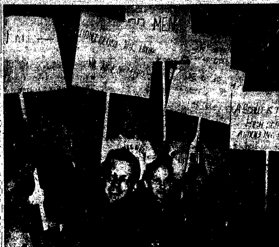
Cardinal Mooney High School seniors appeared at a watermelon lunch drive meeting. Youngsters are from St. John's parish, Greece, where proposed new school will be built.