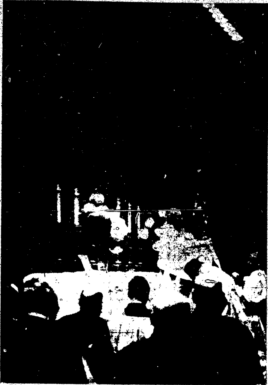
Bishop Kearney gives benediction on stage at Rochester Community War Memorial Wednesday. Eight thousand attended the launching of public phase of four million dollar drive to build two new Catholic high schools in Monroe County.