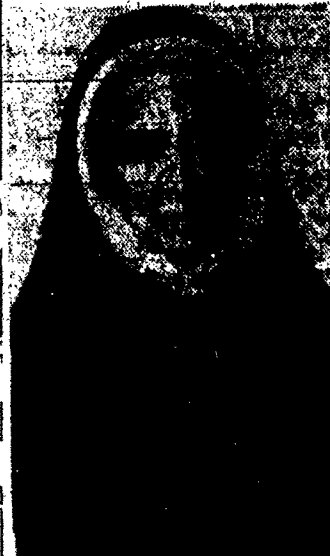
BLESSED THERESE → Soon after the priest's death, other retreat houses were open.