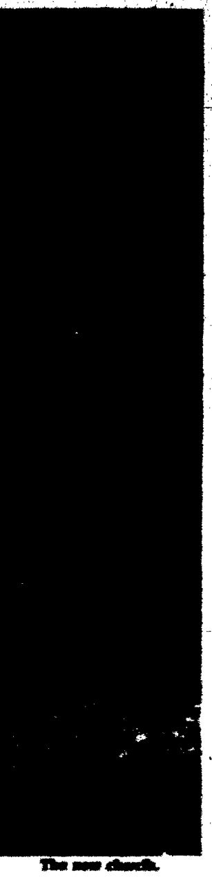
The new church.

William Schickel of New York City was architect for the 170,000-Gallon structure with a soaring Gothic spire reaching 100 feet. The silver jubilee of the parish city will five watched the and then blessed the corner church in 1957.