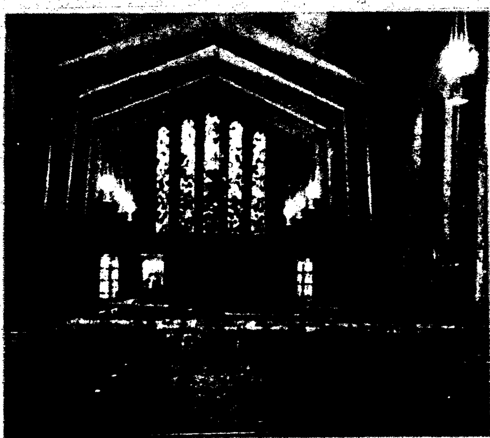
New St. Ambrose Church altar is near center of edifice.