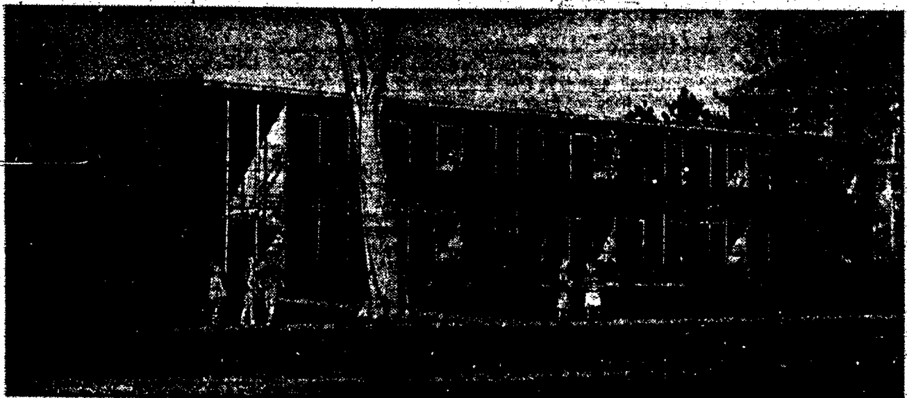
Architect's drawing of new St. Patrick's School, Seneca Falls