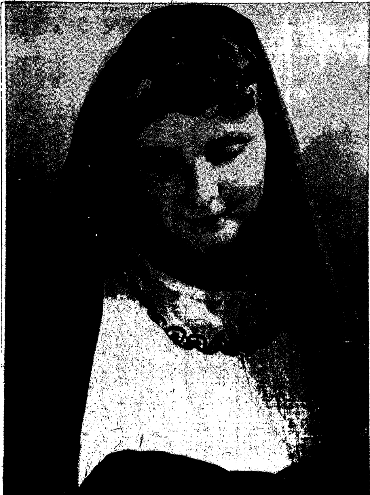
'O Come, Let Us Adore Him'