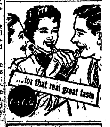
for that real great taste