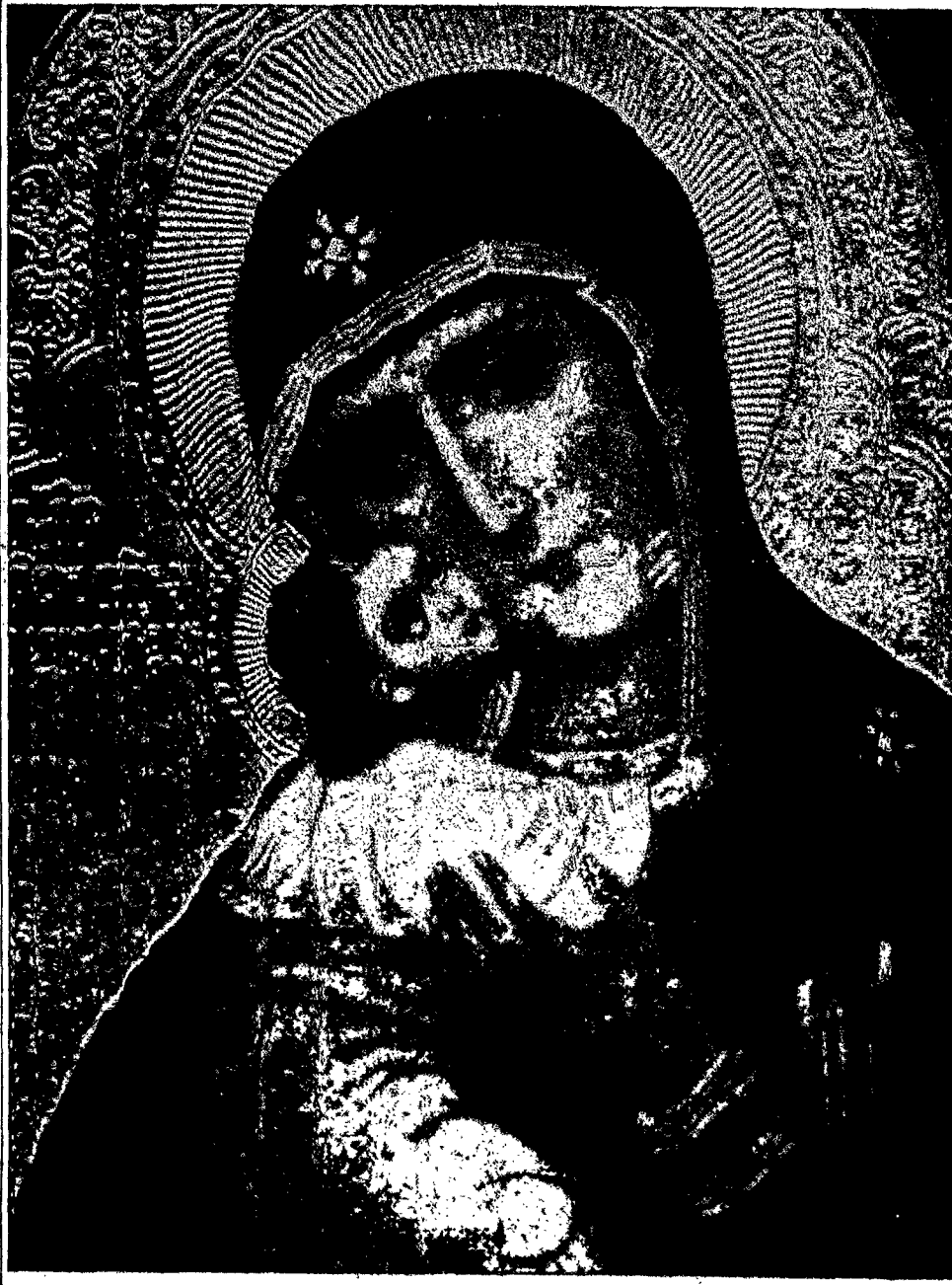
Sodalities will promote devotion to Blessed Virgin Mary as represented in this Russian icon of Our Lady of Vladimir.