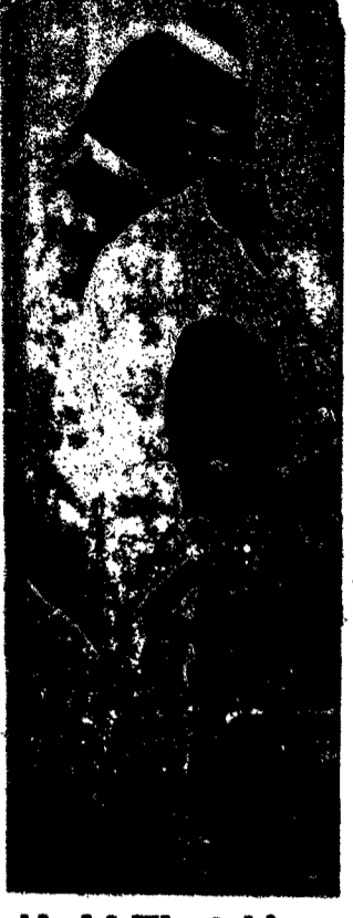
Hold That Line

San Palermo's orchestra provided the music for dancing. Refreshments included cider and doughnuts.