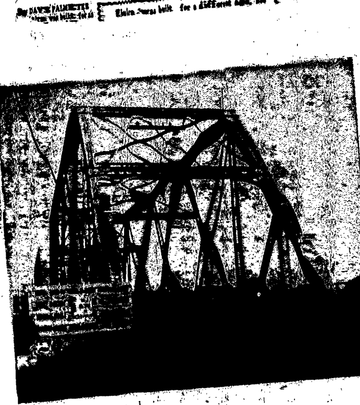
WALNUT STREET BRIDGE