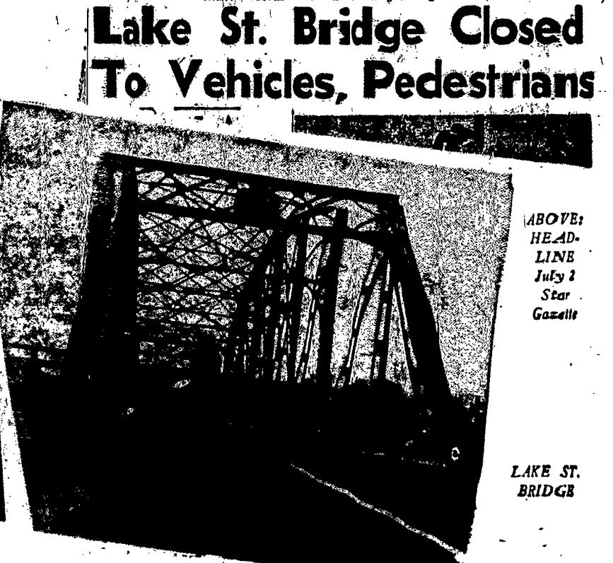
ABOVE: HEADLINE July 2 Star Gazette