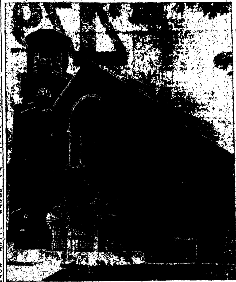
Our Lady of Mt. Carmel Church, Rochester