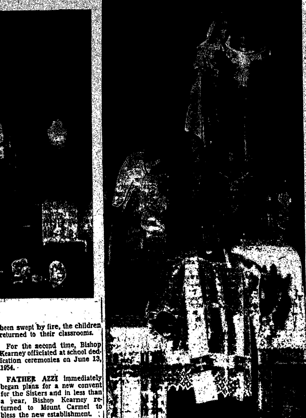
Monsignor Anselmo Fiori preaches beneath the statue of Our Lady of Mt. Carmel at the church's main altar.