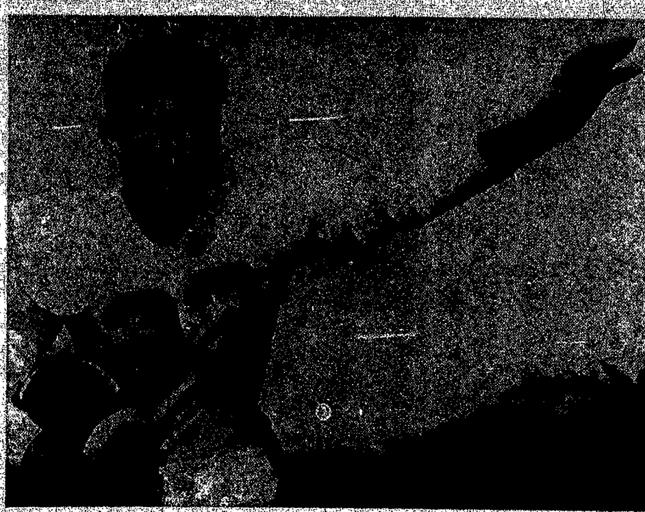
Larry Hurley of Aquinas ready for opening game.

DANDY SUPER MARKET 561 E. CHURCH ST., ELMIRA, RE. 4-7725 or 2-4222 A COMPLETE FOOD STORE WEEKEND SPECIALS Chase & Sanborn Coffee 1 LB. 67¢ Campbell's Tomato Soup 10¢ 99¢ PINK SALMON 1 LB. 53¢ Open 8 a.m. to 10 p.m. Daily incl. Sun