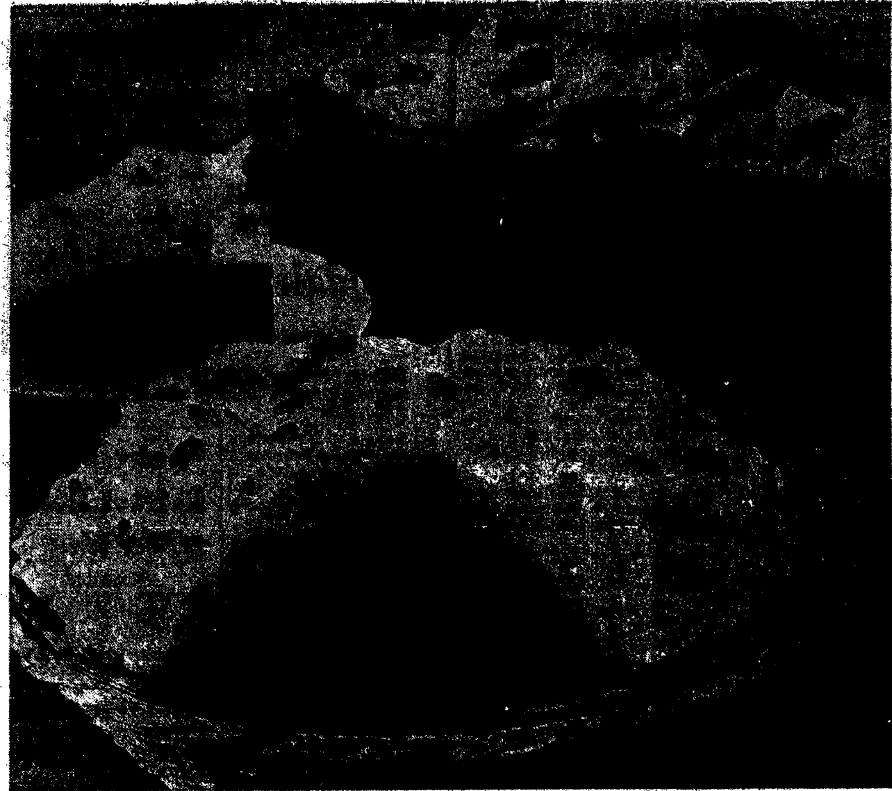
When company comes, or just for the family — delicious Meat 'n Tater Pie

AN ORDER FOUNDED IN 1811, REIMS, FRANCE Framing and Etching, Inc. sole distributors, New York, N.Y., Chicago, Ill., San Francisco, Calif.