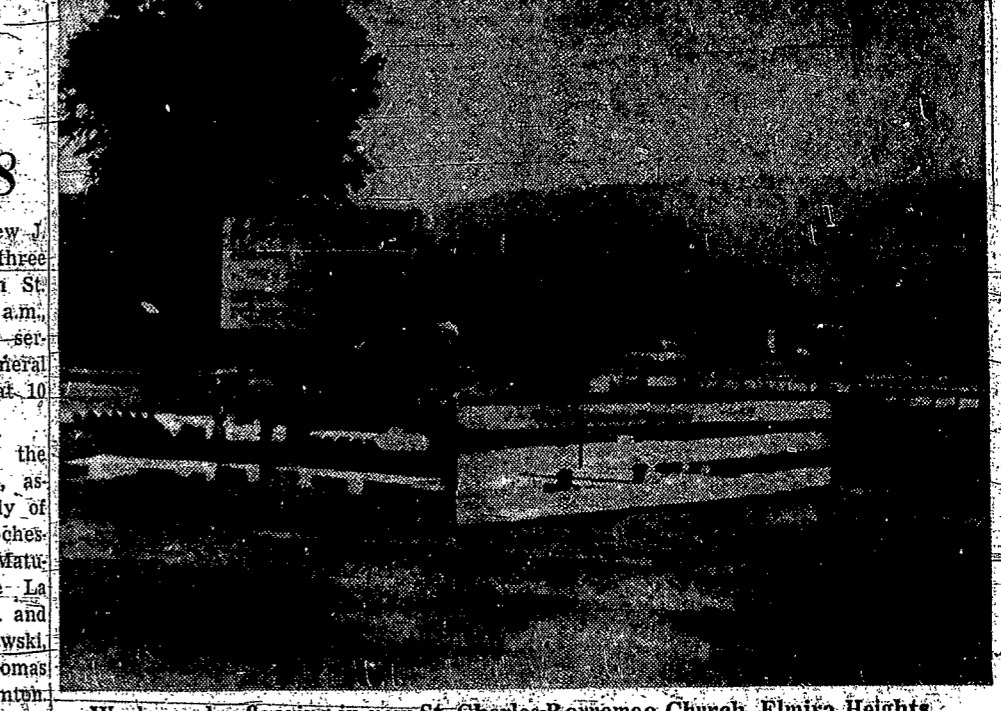
Workmen lay flooring in new St. Charles Borromeo Church, Elmira Heights.

Six Masses are offered each Sunday morning to care for the needs of this fast growing parish — 2 Masses were all that were needed 15 years ago.