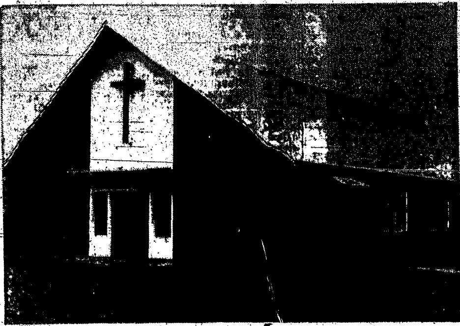
St. Mary's Mission, Honeoye.