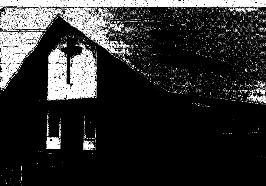
St. Mary's Mission, Honeoye.

Mass and Holy Communion for approximately three hundred children and their parents from St. Mary's of the Lake parish here.