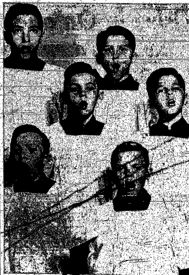
The Bob Mitchell Catholic Boys Choir (shown above) will sing two High Masses and give a Sacred Concert at the Auriesville Shrine on Sunday, July 26. The famous choir of boys will sing at the 12 noon Mass and also at the 4 p.m. Mass. At 4:30 a Sacred Concert will follow the Afternoon Mass. Auriesville is on the New York Thruway at Exit 27 or Exit 28. Non-Catholics are welcome to attend.