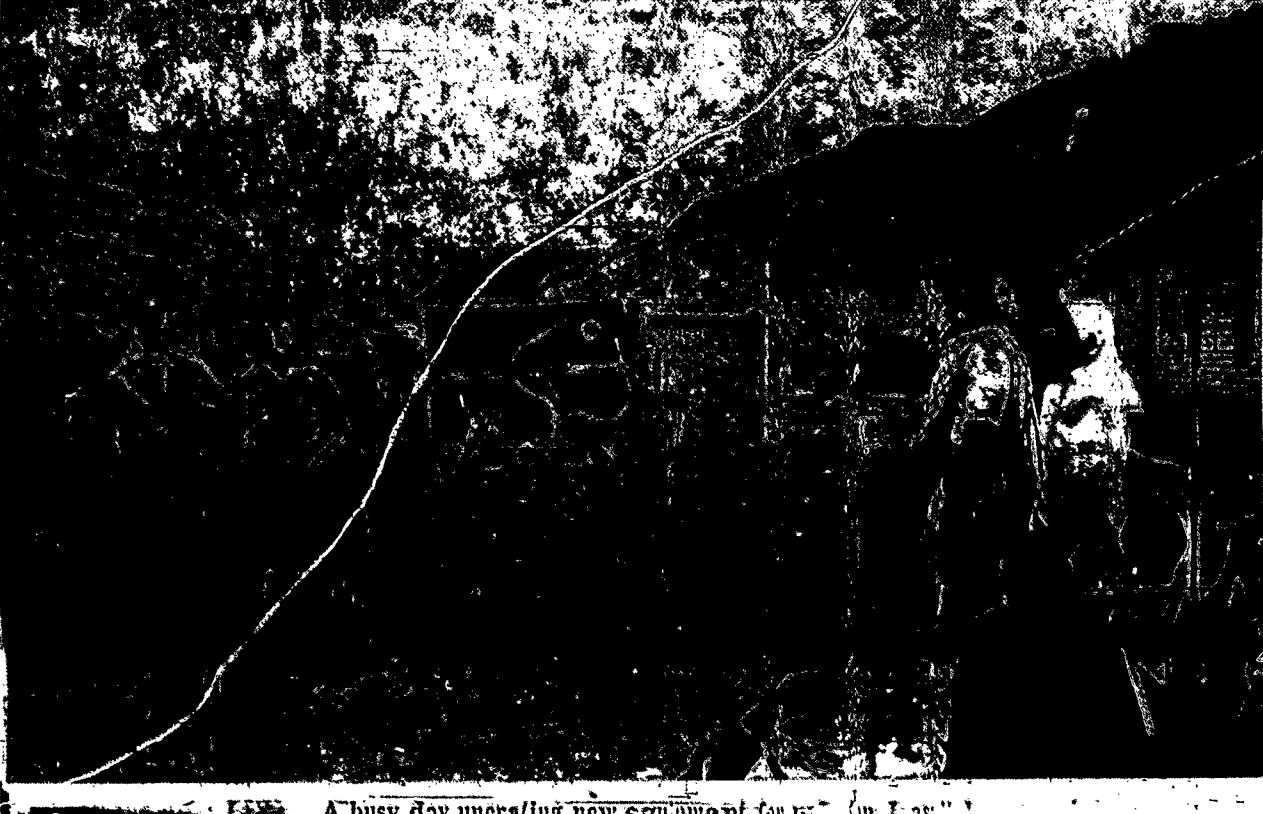
A busy day uncrating new equipment for mission Log.