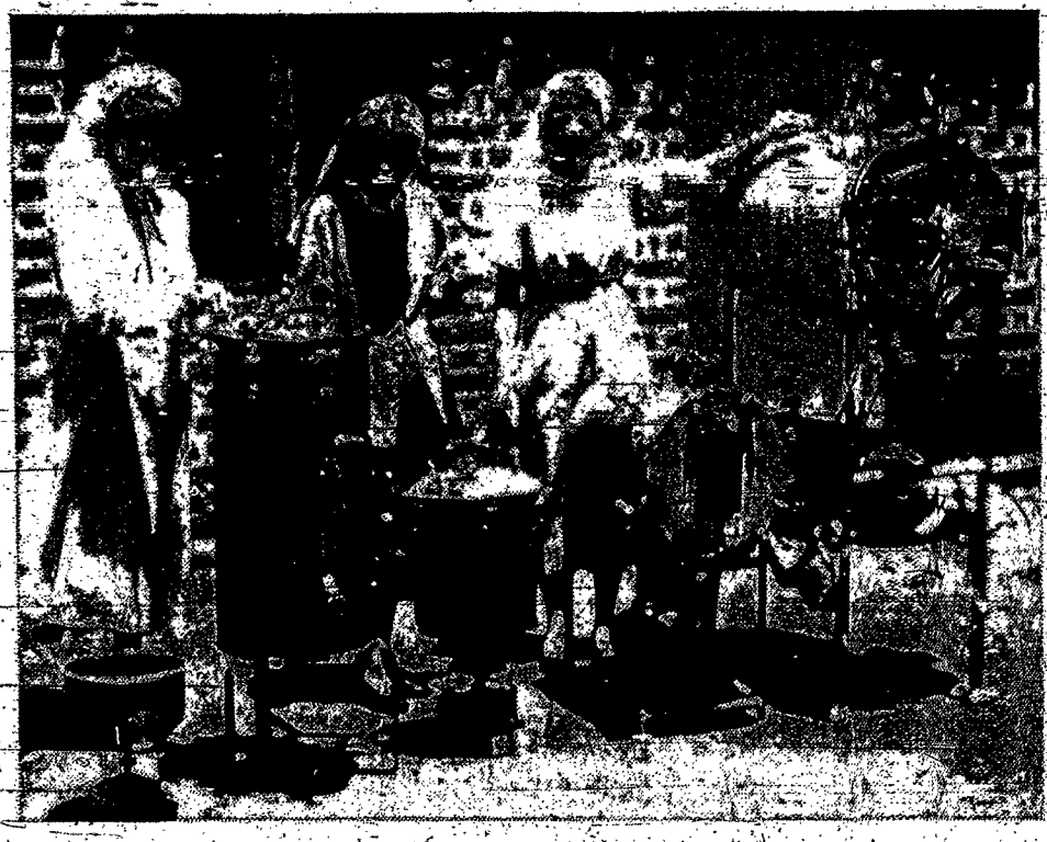
Four years of progress in sterilization — from the bunsen burner pot at left to a second hand unit, then a pressure cooker improvised for the purpose, an Army surplus field piece and finally the up-to-date all-steel unit installed this year (with a made in Rochester label).