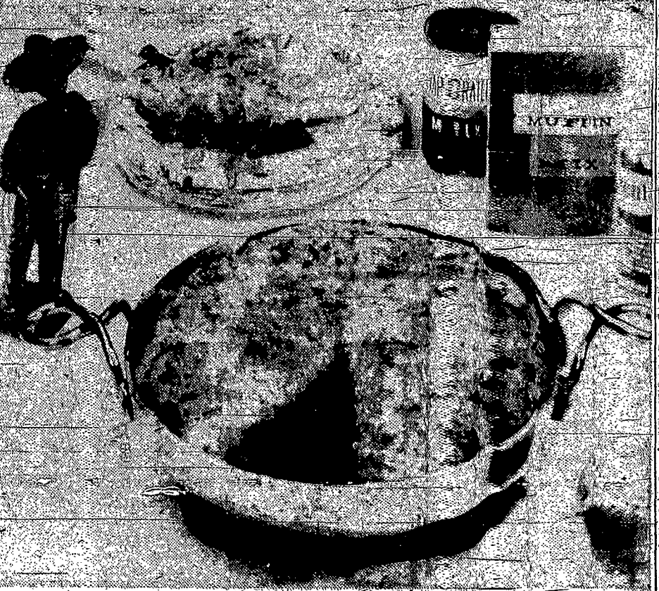
A Tasty Treat from South of the Border.