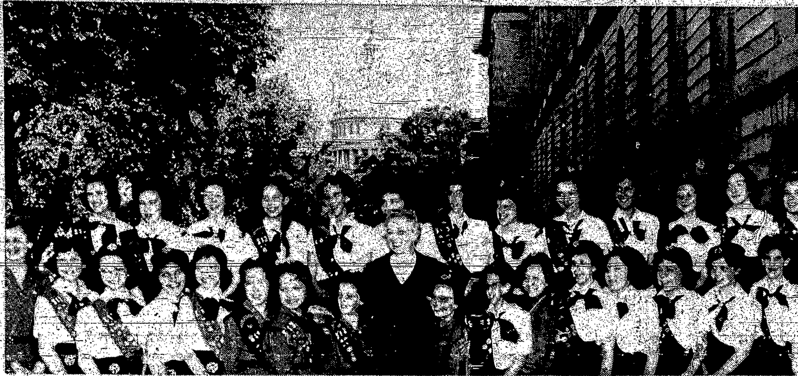
St. Stanislaus Girl Scouts Visit Congresswoman