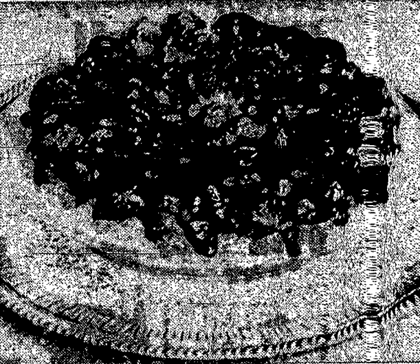
STRAWBERRY CREAM PIE

In the merry month of May, America found strawberries it seems to me that there is a growing wild in what is now sort of magic in the air, that Chill, Peru. We don't know just makes it a joyous great to be in the month of May. The name of the game to be called "Strawberry month" was probably borrowed from the name of a Roman-Greek goddess of Jupiter's day Maia (or Maya), daughter of Atlas and mother of Mercury. May has become a part of our language in many ways than one. For instance, there's MAY-DAY, not only Mayday, but also the famous Air Corps distress signal in World War II. And the MAYPOLE... the MAY APPLE, a North American herb which bears a single white flower. MAYFAIR, a fashionable season of London in which an annual May fair was once held. The MAY FLOWER, which using those luscious ripe, red berries for a dessert treat for shores. MAYFIELD, known to your family. A Strawberry may a fisherman. MAY CREAM PIE with Cereal Crumb CRUST will make a hit.