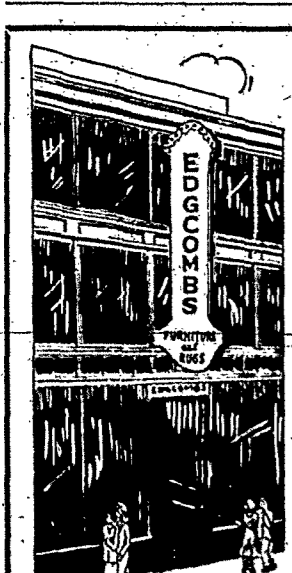
161 N. MAIN ST., Elmira Opposite Mark Twain