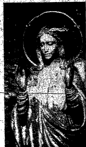
Our Lady of the Cenacle