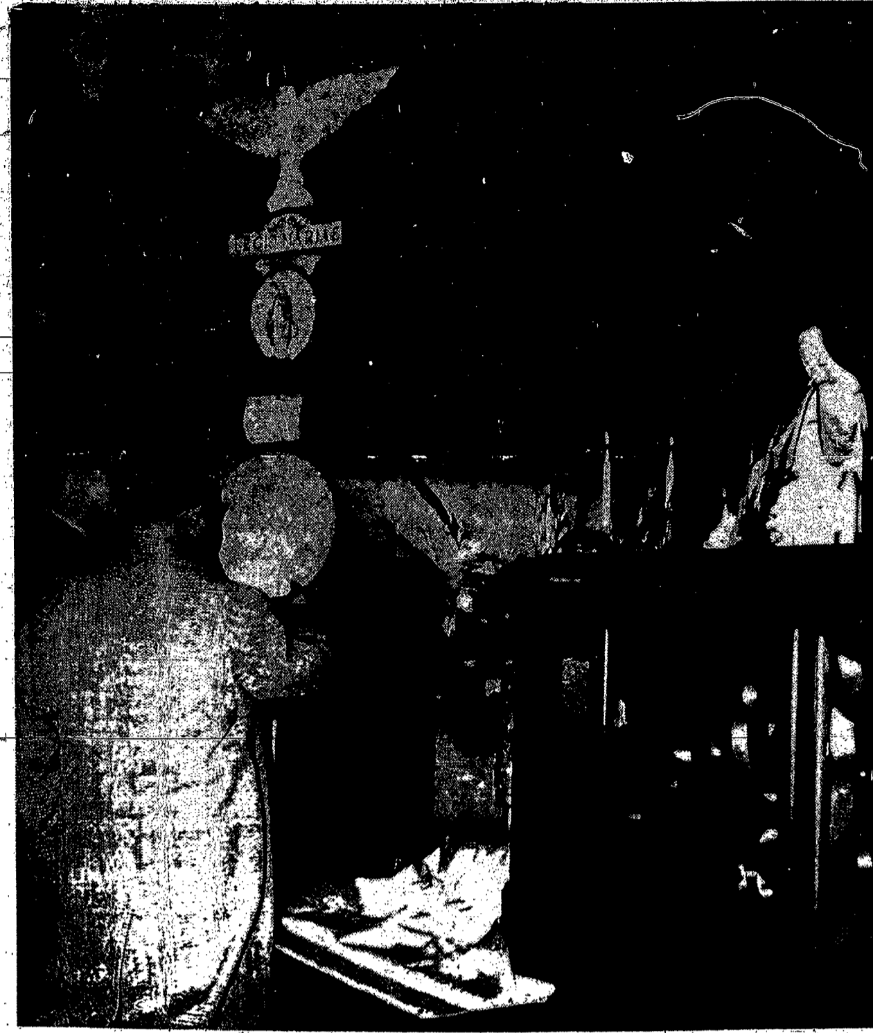
"I AM ALL THINE, my Queen, my Mother, and all that I have is thine," were the words of fealty to the Queen of the Legion of Mary at the Acies held in St. Patrick's Church, Elmira, last Sunday. Among those