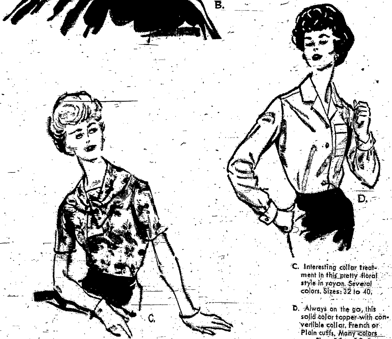
C. Interesting collar treatment in this pretty floral style in rayon. Several colors. Sizes: 32 to 40.