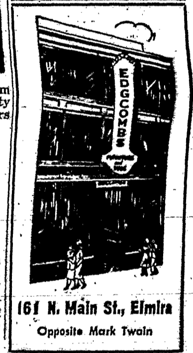
161 N. Main St., Elmira Opposite Mark Twain