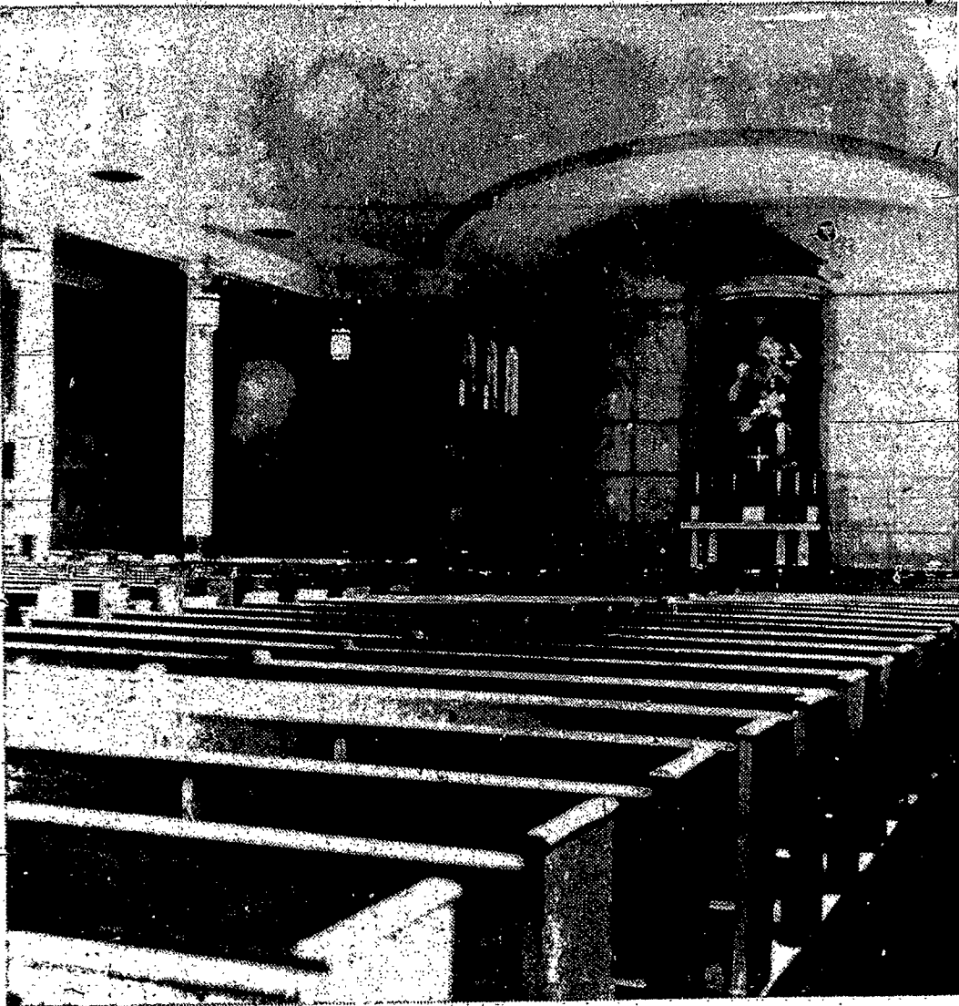
Interior of new church dedicated to St. Anne, mother of the Blessed Virgin Mary.