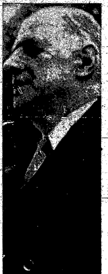
CHARLES DE GAULLE

These have been the characteristic virtues of the 68-year-old soldier-statesman who was graduated from the famous Saint Cyr military academy and rose to top rank after distinguished service in the two world wars, which included taking charge of special missions in Iraq, Persia and Egypt and teaching military history at Saint Cyr.